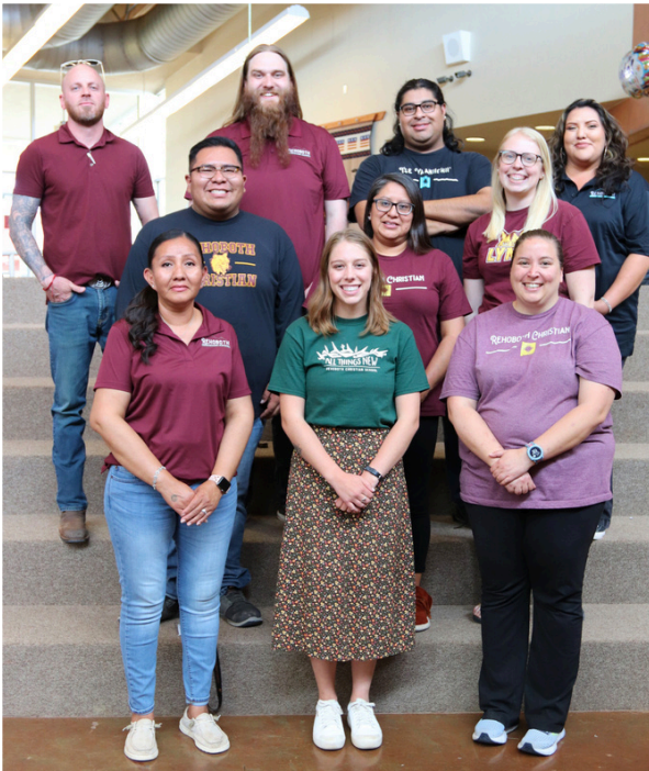
2024 SALT Program Staff

This school year we have been able to expand our program and accept students with more significant needs. We are currently able to offer speech, occupational, and physical therapies, as well as life skills experiences through community work study placements.